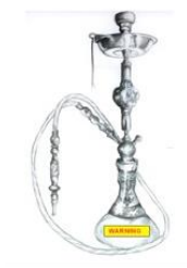
Figure 2. Health warning label locations on the waterpipe device