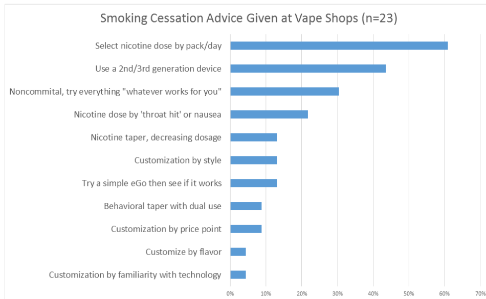
Figure 4. Frequency of types of smoking cessation advice given to customers, as reported by employees of San Francisco/Bay Area vape shops.

offered discounts on e-juice, mainly based on quantity (e.g., buy 2, get the 3rd 50% off) and the average discount was 16% (SD=12). Stores sold a wide variety of different e-juice flavors and carried 97 (SD=83) on average.